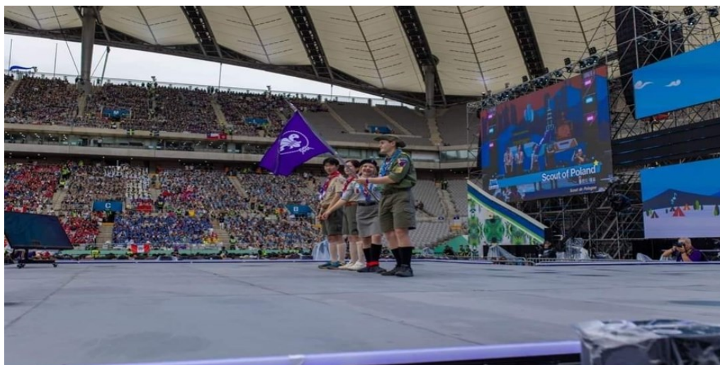
The closing ceremony in South Korea – handing the flag over to the Polish Scouts – for the 2027 World Jamboree